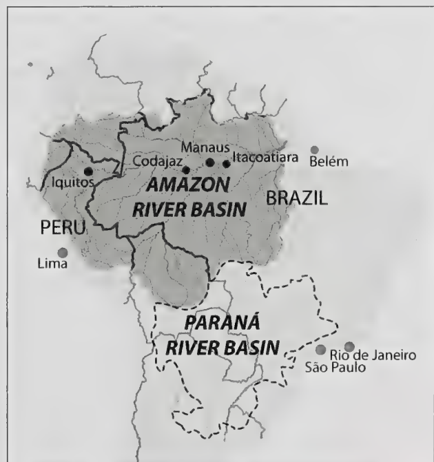
Fig. 6. Map of South America with two principal river basins, Amazon and Paraná Rivers.

Extensive material of proteocephalidean cestodes was collected in a wide spectrum of teleosts during six visits by the present authors and their co-workers to the Peruvian Amazonia. This material will make it possible to compare the species composition of the cestode fauna and host-parasite associations in the Amazon River basin with those in the Paraná River basin (Fig. 6). Some proteocephalideans occur in closely related hosts from different river basins, such as Proteocephalus macrophallus and P. microscopicus in species of Cichla Bloch & Schneider, 1801, or in recently separated 'couples' of fish hosts that occur only in one of the two principal river basins in South America, i.e. Amazon and Paraná, such as Zungaro zungaro in the former river basin and Z. jahu in the latter one.